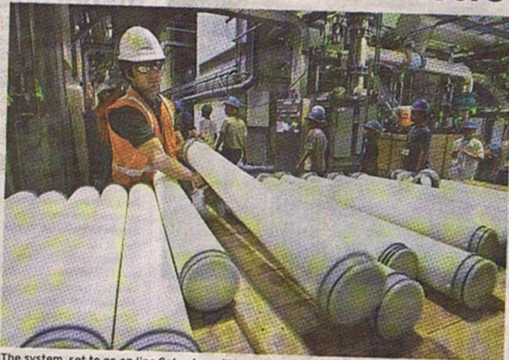
The system, set to go on line Saturday, will put treated water that was once sewage into a groundwater basin, where it later would be drawn for human consumption. > OC POST

“ I know the technology works. ... It's logical and practical. ”